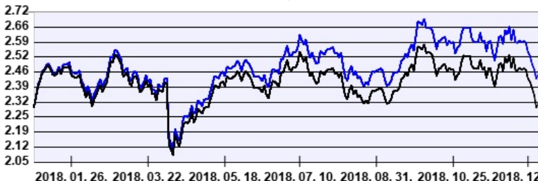
NET ASSET VALUE PER SHARE, 01/01/2018 - 12/31/2018

— Aegon Russia Equity Fund institutional series — Benchmark