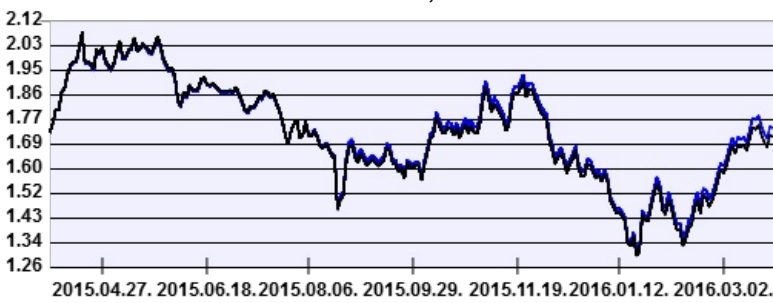
NET ASSET VALUE PER SHARE, 04/01/2015 - 03/31/2016

— Aegon Russia Equity Fund HUF series — Benchmark