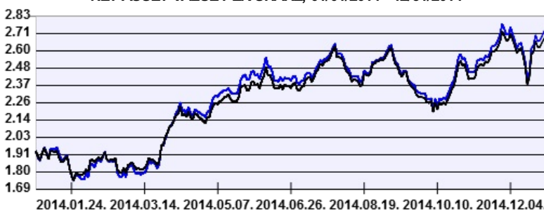
NET ASSET VALUE PER SHARE, 01/01/2014 - 12/31/2014

— AEGON IstanBull Equity Fund institutional series — Benchmark