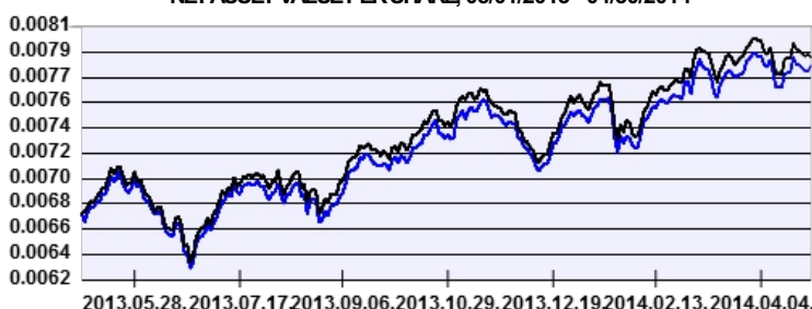
NET ASSET VALUE PER SHARE, 05/01/2013 - 04/30/2014

— AEGON Climate Change Equity Fund EUR series — Benchmark