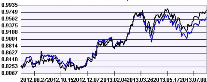
NET ASSET VALUE PER SHARE, 08/01/2012 - 07/31/2013

--- AEGON International Equity Fund HUF series --- Benchmark