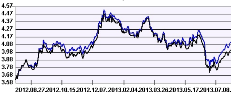
NET ASSET VALUE PER SHARE, 08/01/2012 - 07/31/2013

----- AEGON Central European Equity Fund institutional series