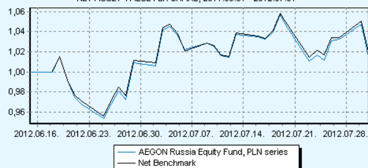
NET ASSET VALUE PER SHARE, 2011.08.01 - 2012.07.31

Past performance is no guarantee of future results. This report should not be considered as an offer or investment advisory. The Fund Prospectus contains the detailed conditions of the investment. The distribution costs of the fund purchase can be found at the distributors.