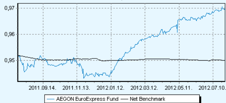
NET ASSET VALUE PER SHARE, 2011.08.01 - 2012.07.31

Past performance is no guarantee of future results. This report should not be considered as an offer or investment advisory. The Fund Prospectus contains the detailed conditions of the investment. The distribution costs of the fund purchase can be found at the distributors.