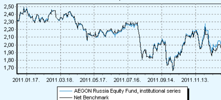
NET ASSET VALUE PER SHARE, 2011.01.01 - 2011.12.31

Past performance is no guarantee of future results. This report should not be considered as an offer or investment advisory. The Fund Prospectus contains the detailed conditions of the investment. The distribution costs of the fund purchase can be found at the distributors.