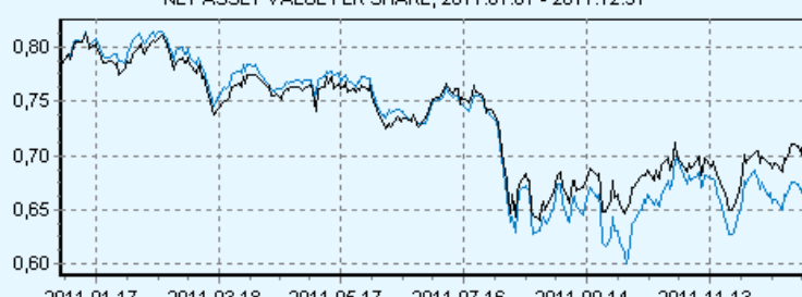
NET ASSET VALUE PER SHARE, 2011.01.01 - 2011.12.31

Past performance is no guarantee of future results. This report should not be considered as an offer or investment advisory. The Fund Prospectus contains the detailed conditions of the investment. The distribution costs of the fund purchase can be found at the distributors.