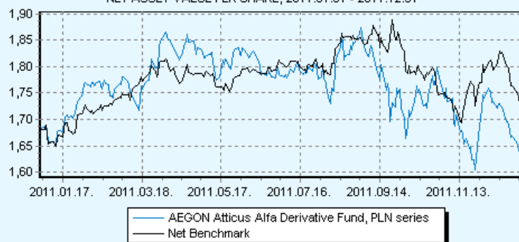
NET ASSET VALUE PER SHARE, 2011.01.01 - 2011.12.31

Past performance is no guarantee of future results. This report should not be considered as an offer or investment advisory. The Fund Prospectus contains the detailed conditions of the investment. The distribution costs of the fund purchase can be found at the distributors.