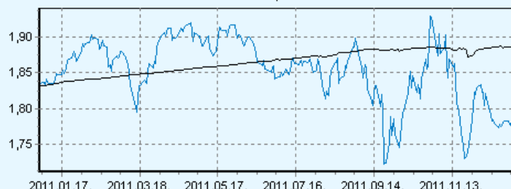
NET ASSET VALUE PER SHARE, 2011.01.01 - 2011.12.31

Past performance is no guarantee of future results. This report should not be considered as an offer or investment advisory. The Fund Prospectus contains the detailed conditions of the investment. The distribution costs of the fund purchase can be found at the distributors.